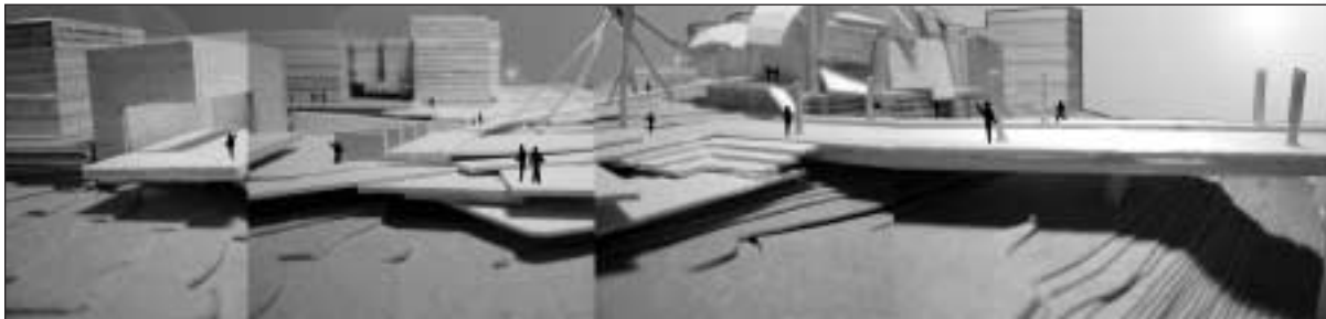
Option B - Place humans and transit at same grade creating multi-modal space (view of sculpter garden)