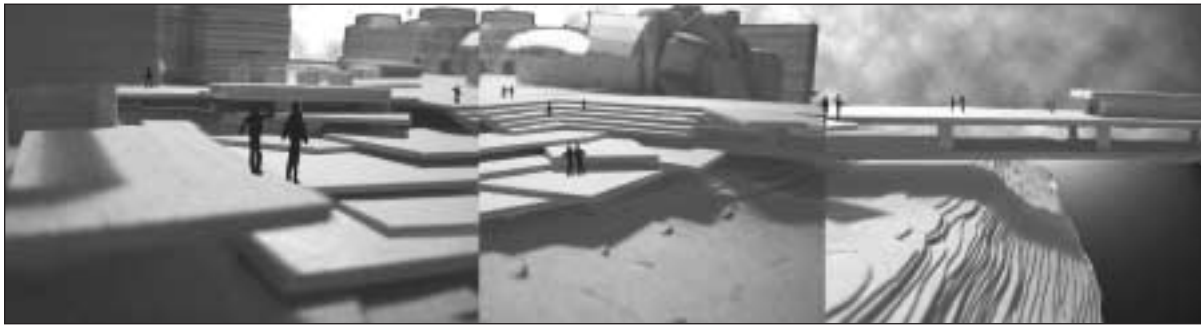
Option A - Burying Washington Avenue below grade and creating pedestrian plaza above (view of sculpter garden)